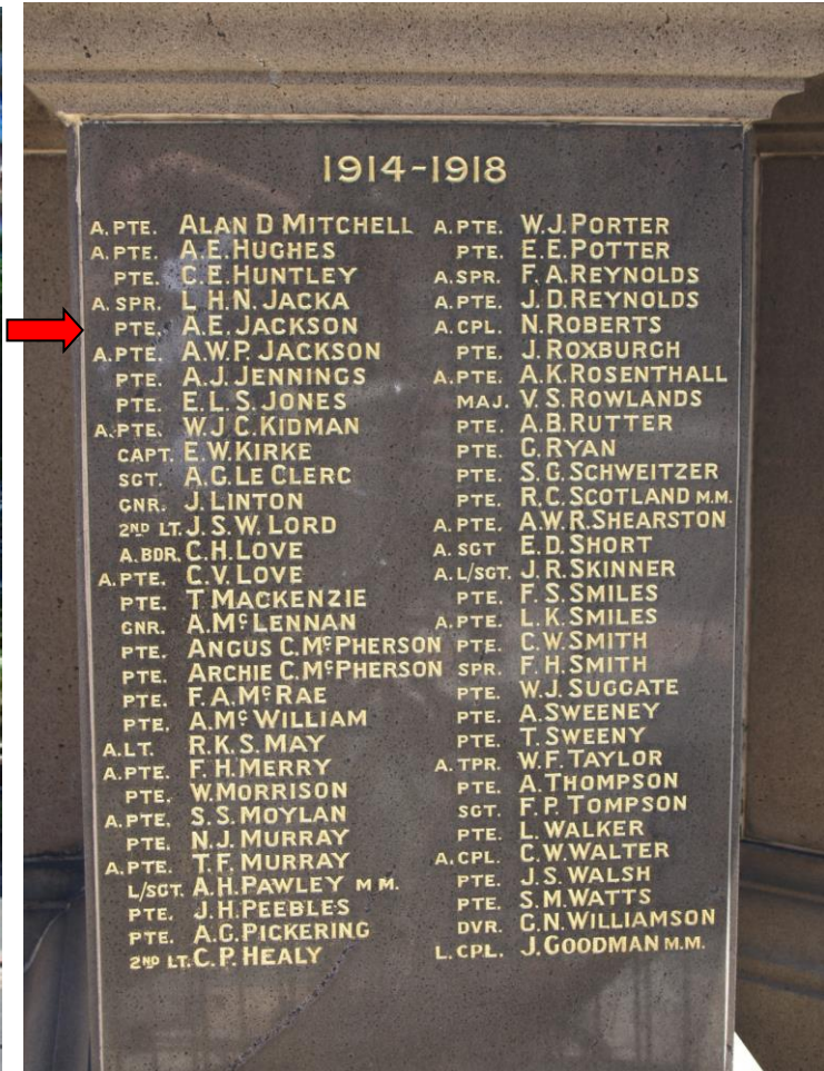
Manly War Memorial