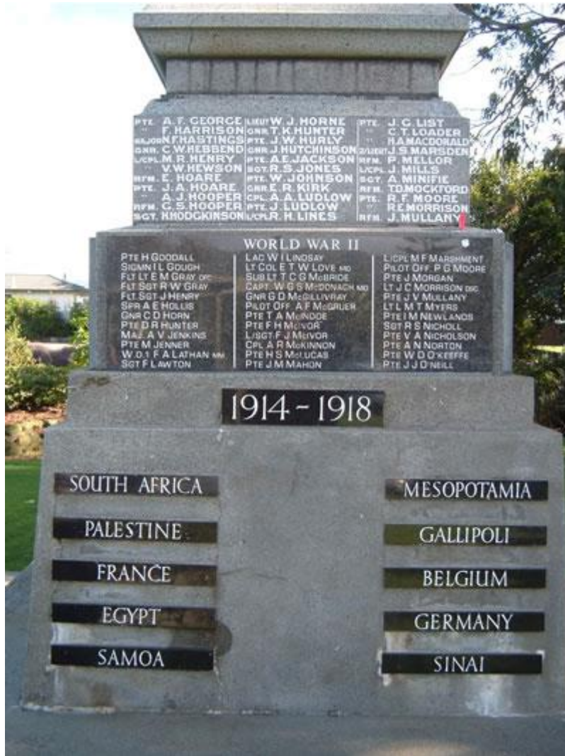
Petone War Memorial