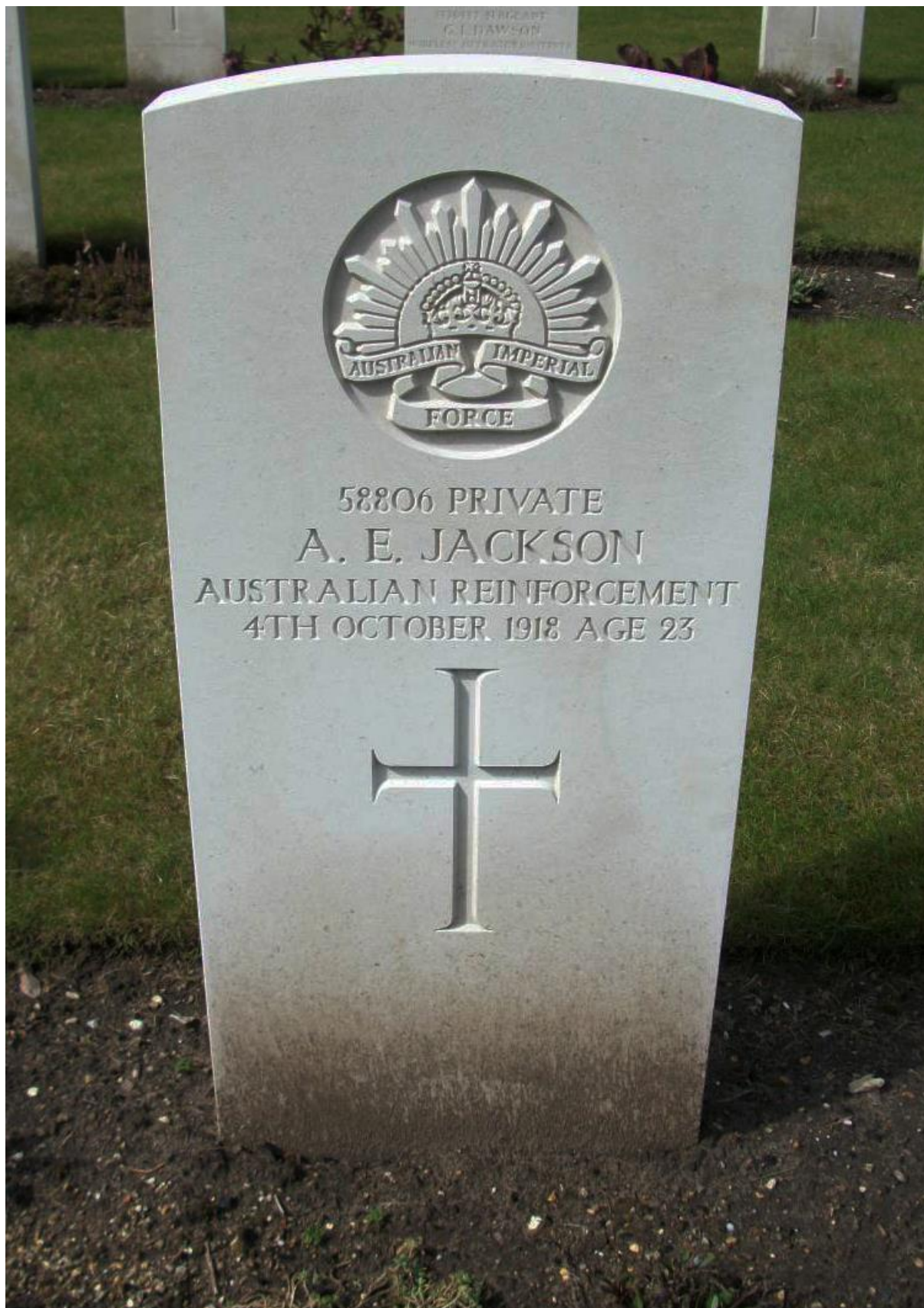
Photo of Private A. E. Jackson's Commonwealth War Graves Commission Headstone in Brookwood Military Cemetery, Surrey, England.